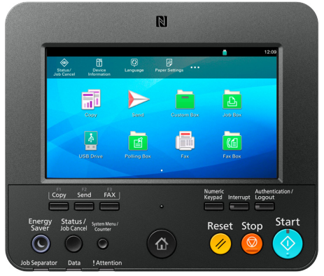
CS 508ci / 408ci / 358ci control panel